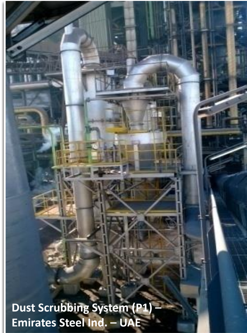
Dust Scrubbing System (P1) – Emirates Steel Ind. – UAE