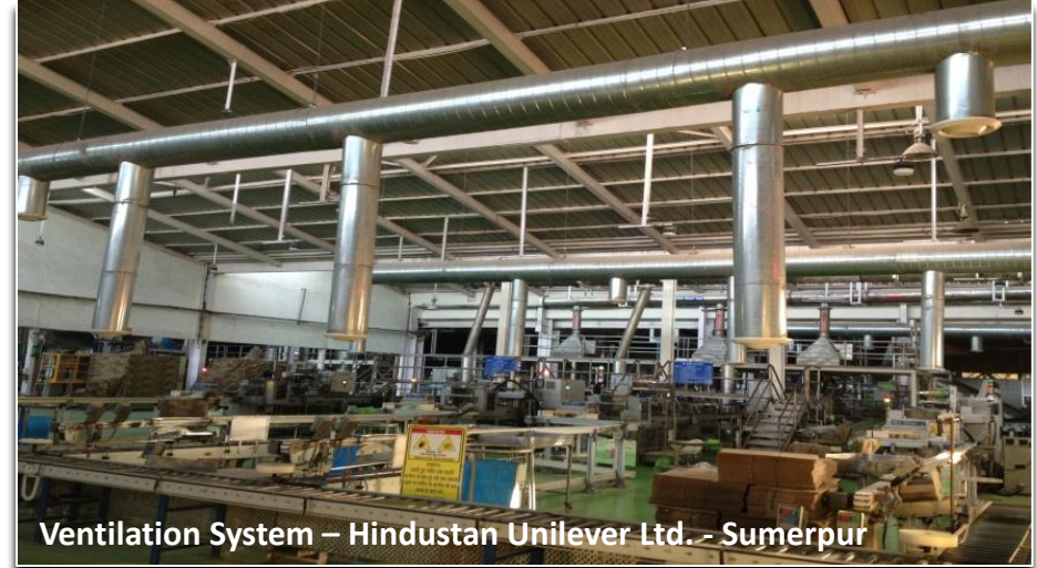
Ventilation System – Hindustan Unilever Ltd. - Sumerpur