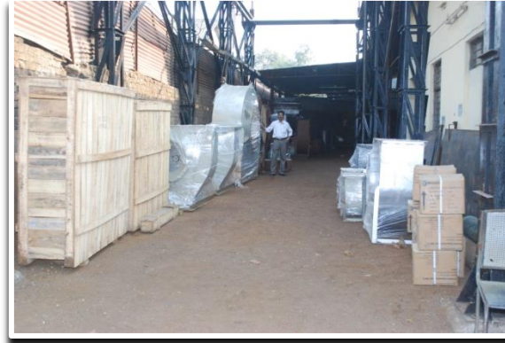
UNIT 2- W/217 MIDC TALOJA