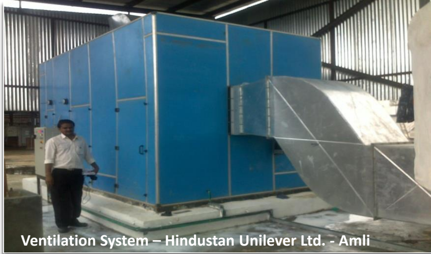
Ventilation System – Hindustan Unilever Ltd. - Amla