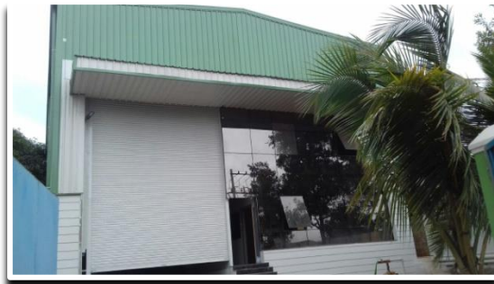
UNIT-3 - KIADB BELGAUM