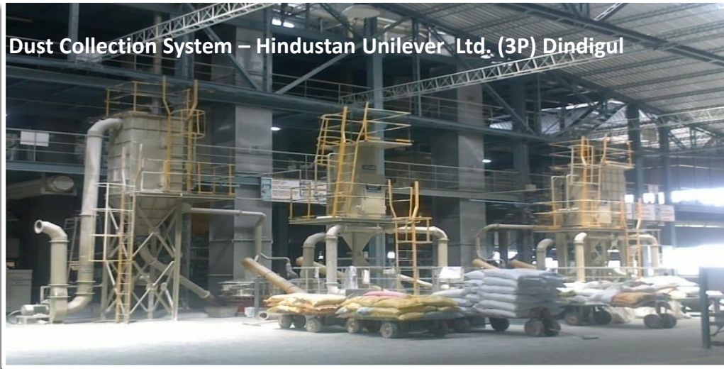
Dust Collection System – Hindustan Unilever Ltd. (3P) Dindigul