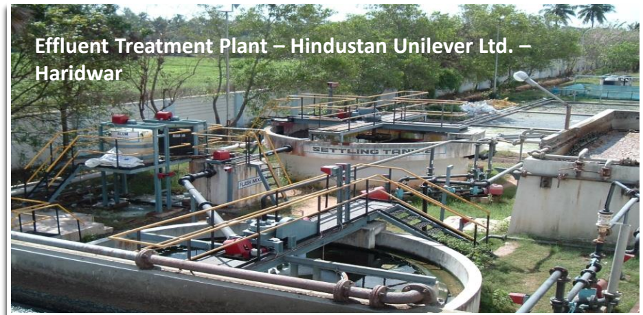
Effluent Treatment Plant – Hindustan Unilever Ltd. – Haridwar