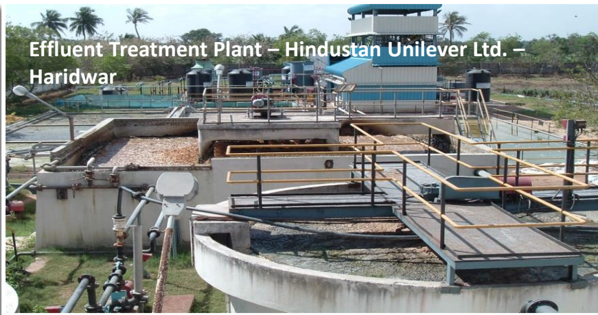
Effluent Treatment Plant – Hindustan Unilever Ltd. – Haridwar