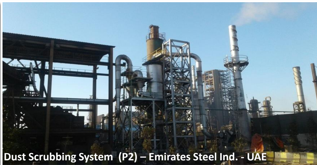
Dust Scrubbing System (P2) – Emirates Steel Ind. - UAE